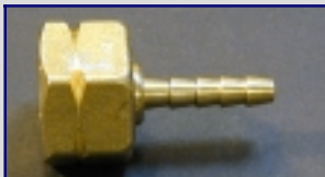
S/T BUTANE N/TAIL