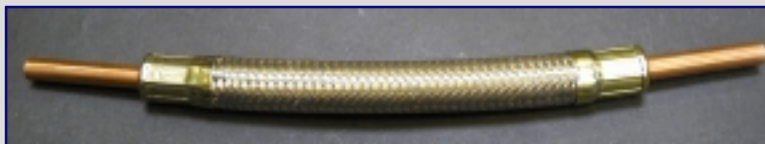
STAINLESS STEEL OVERBRAIDED COOKER HOSE - SUITABLE FOR LEISURE BOATS ETC.

(PLEASE REFER TO PRICE LIST OR CONTACT OUR SALES LINE FOR BEST PRICE)