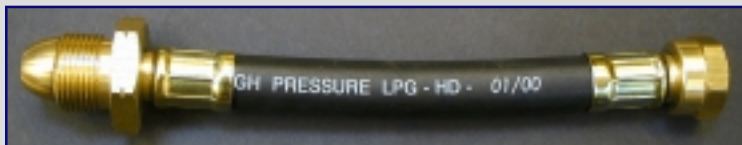
S/T or N/R POL X W20 NUT/TAIL