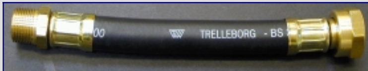
3/8" BSPT X W20 NUT/TAIL