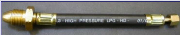
S/T or N/R POL X 1/4" STANDPIPE/NUT/OLIVE