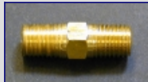
BSPT M X M ADAPTOR