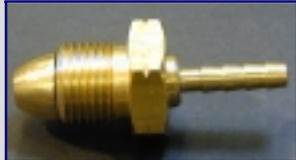
S/T OR N/R POL NUT/TAIL