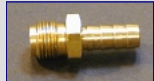
1/4" INVERTED FLARE