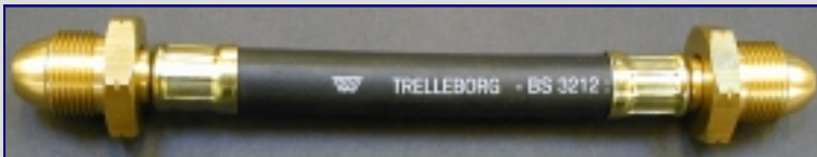
S/T POL X S/T POL