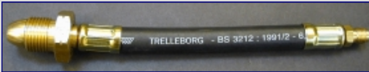
S/T or N/R POL X 1/4" INVERTED FLARE