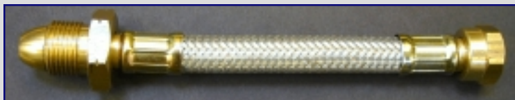
S/T OR N/R POL X W20 NUT/TAIL

Our heavy duty black propane hose is manufactured by Trelleborg Industries and is specifically designed for pigtail assemblies