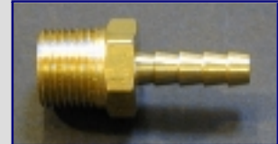
1/4" NPT MALE