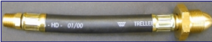
3/8" BSPT X S/T or N/R POL