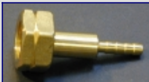
N/R BUTANE N/TAIL