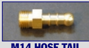
M14 HOSE TAIL