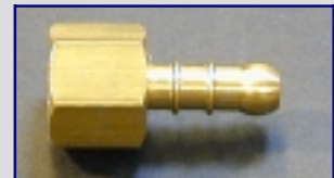
5/8" UNF N/TAIL