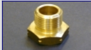
STANDARD POL NUT