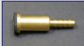
N/R BUTANE TAIL